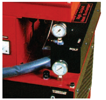
Consistent dynamic mix pressure