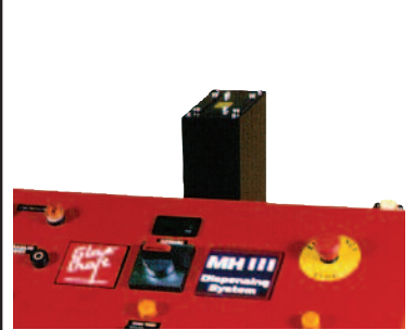
Pump retract switch